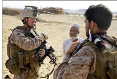
During mission Limited interaction with cultural interpreters & speech-to-speech machine translation*