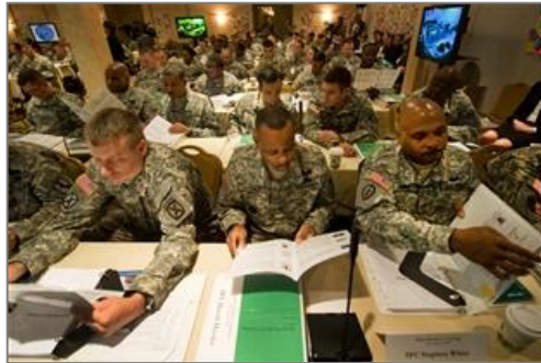
Before mission Hand-crafted cultural training