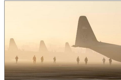
After mission Manual after-action analysis of social interaction